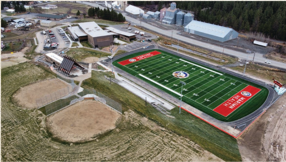
Marimn Health and Wellness Facilities and Medical Center