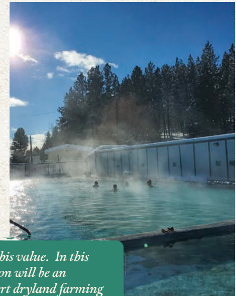
Zims Hot Springs

“Water has always been an invaluable resource in the West and the impacts of climate change have amplified this value. In this context, I believe the multiple-use water rights decreed to the Tribe under the Snake River Basin Adjudication will be an important economic tool for the Tribe now and in the future. For example, this water could be used to convert dryland farming to irrigated crops or water byproducts.”