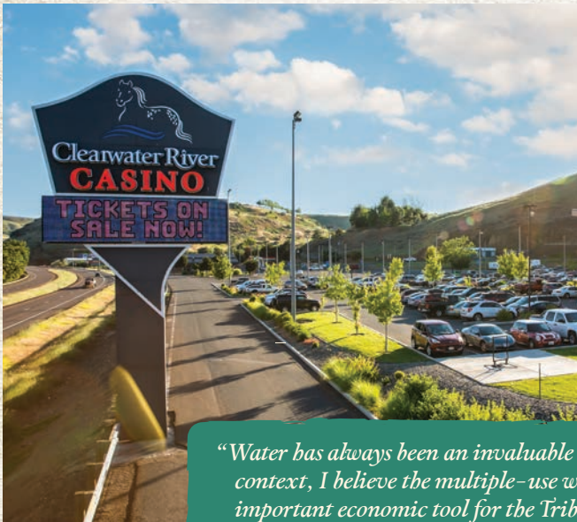
Clearwater River Casino