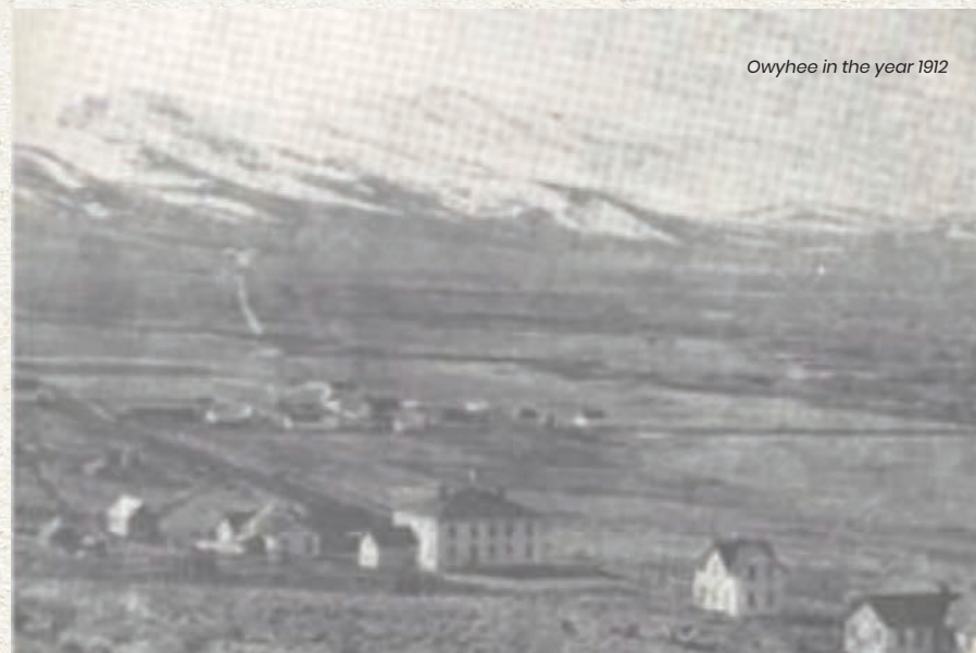
Owyhee in the year 1912

Farming and ranching remain mainstays for Duck Valley and are reflected in the 12,000 acres of subjugated lands. The Duck Valley Reservation is composed of 289,819 acres held in trust by the United States Government for the use and occupancy of the Shoshone-Paiute Tribes. Included in the total acreage of the Reservation are 22,231 acres of Wetlands. Wildhorse Reservoir was constructed in 1936 for the Duck Valley Irrigation Project. Tribal membership is over 2,000, with approximately 1,700 living on the reservation. The Shoshone-Paiute Tribes of Duck Valley continue to exist within the original territories of their ancestors