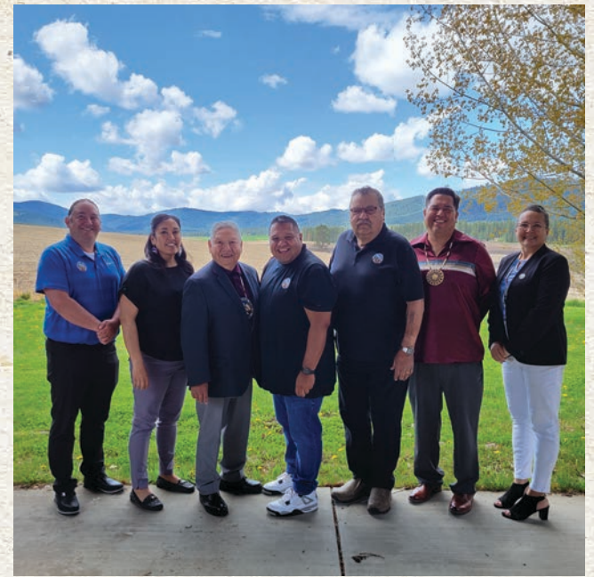
Coeur d'Alene Tribal Council