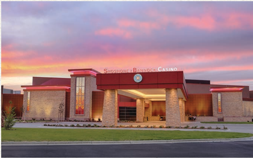
Shoshone-Bannock Casino Hotel