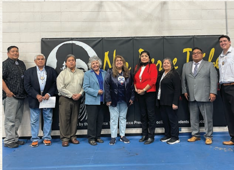
Nez Perce Tribal Council