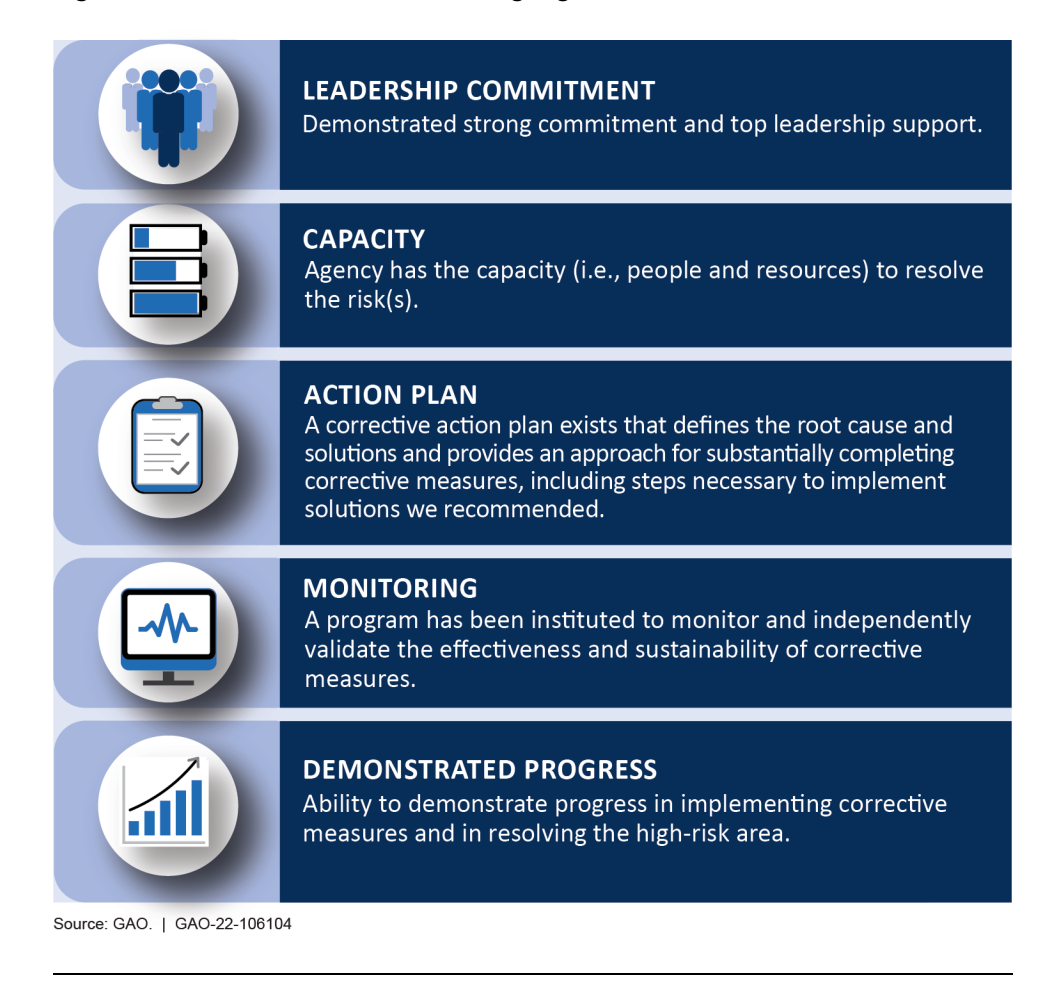
Figure 1: Criteria Essential to Addressing High-Risk Areas

<sup>8</sup>In addition, 2 high-risk areas have been consolidated, and 1 area was originally part of another area but subsequently made its own.