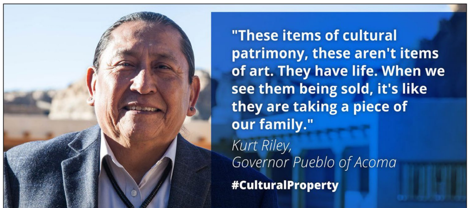
Image from a Department of State Social Media Campaign to Raise Awareness about Protecting Native American Cultural Items

Source: Department of State. | GAO-22-105685