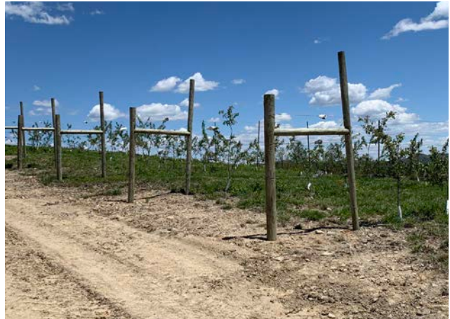
Patriot Gardens Experimental Orchard Project in Nicholas County, WV.

and maintain approximately 97,000 trees and construct a 50,000-square-foot processing and storage facility, commercial greenhouses, and a research station. Further expansion of this site is expected to reach a total of 1 million trees and an estimated 379 to 481 jobs once the facility is at full production.