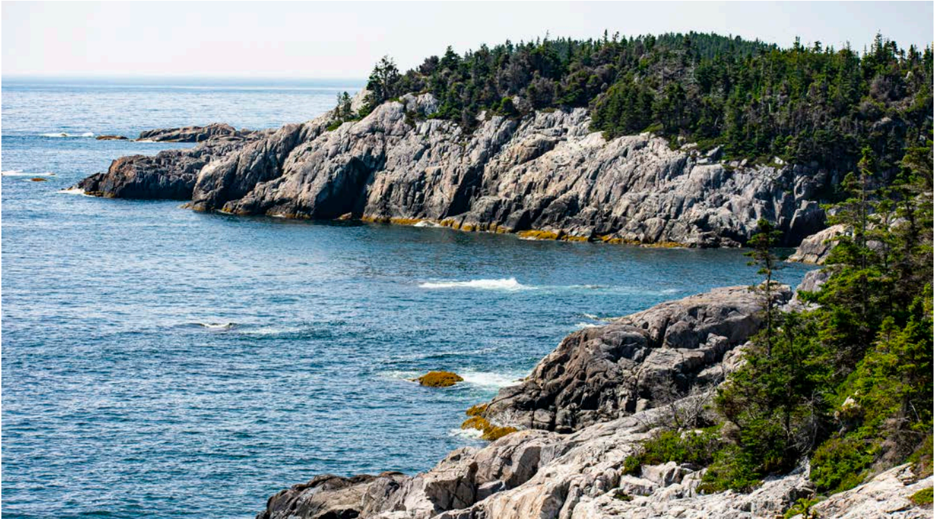
Isle au Haut in Acadia National Park.

inherently focus on climate challenges. Similar to farmers, ranchers, community planners, and disaster preparedness professionals across the country, Interior land and resource managers are seeing changes on the ground and are working to address them. Increasing drought, higher risk of severe storms and extreme wildfires, changes to where species live and migrate and the diseases they face, warmer water temperatures, and new threats from invasive species are among the tangible challenges land and resource managers face right now.