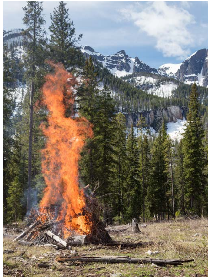
Burning as part of the Northeast Entrance fuels project in Yellowstone.

The 2022 budget includes $1.1 billion in discretionary funding to support Interior's Wildland Fire Management program, an increase of $117.8