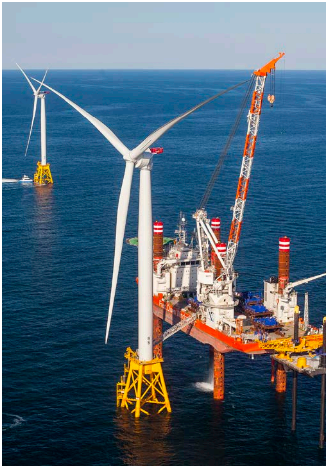
Block Island Wind Farm, New Shoreham, RI.

In anticipation of large-scale development of offshore wind energy on the Outer Continental Shelf (OCS), BSEE is preparing to take on new responsibilities with respect to renewable energy workplace and process safety management, environmental protection, and decommissioning and site restoration. BSEE is also assuming safety and environmental enforcement operational functions for Federal OCS offshore renewable energy development. In 2022, the BSEE budget includes $9.8 million, an increase of $9.0 million, to establish a core