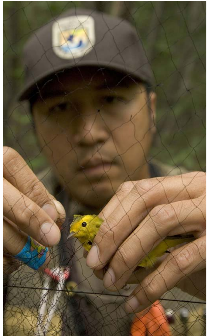
Fish and Wildlife Service biologist untangling a bird from a mist net.

The 2022 budget increases investment in established ongoing programs that are also critically important to climate science. For example, the budget includes $84.4 million, an increase of $43.1 million from the 2021 enacted level, to support regional Climate Adaptation Science Centers (CASCs). The CASCs can play an expanded role to build new relationships and collaborations among Federal, State, and local partners around climate science. This investment will ensure that resource management agencies can integrate the best available climate science into everyday activities. The 2022 budget includes $36.4 million for Land Change Science, an increase of $17.2 million from the 2021 enacted level, to support additional research on biologic carbon sequestration; climate impacts on fish, wildlife, and habitat; monitoring of greenhouse gas reduction; and existing partnerships with Tribal and indigenous