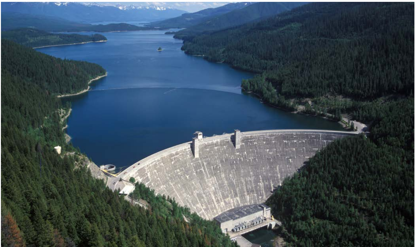
Hungry Horse Dam in Northwest Montana.

Interior’s Bureau of Reclamation brings water to more than 31 million people in the West, and provides one out of five western farmers with irrigation water for 10 million acres of farmland that produce 60 percent of the Nation’s vegetables and 25 percent of its fruits and nuts. As a water management agency, Reclamation’s operations and missions are directly affected by the changing climate. Reclamation also manages a suite of water conservation, recycling, and planning programs to help communities mitigate drought and climate change impacts. The 2022 budget includes $54.1 million for Reclamation’s WaterSMART (Sustain and Manage America’s Resources for Tomorrow) programs, which work cooperatively with States, Tribes, and local communities as they plan for and implement actions to increase water supply. Cumulatively,