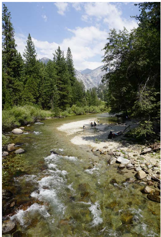
Kings River in Kings Canyon National Park, CA.

Land and Water Conservation Fund —Thanks to broad bipartisan support of GAOA in 2020, $900.0 million in mandatory LWCF resources is made available annually for conservation and recreation activities managed by Interior and the U.S. Forest Service. In 2021, Interior will provide $420.8 million