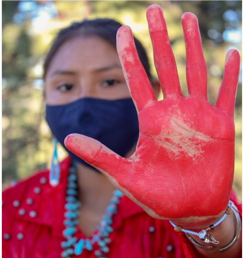
Youth from Northern Arizona unite in support of Missing and Murdered American Indians and Alaska Natives Awareness Day 2021.

The Act establishes a Joint Commission to which the Secretary of the Interior and Attorney General appoint members. The Commission must be composed of at least 27 Federal and non-Federal members who represent diverse experiences, backgrounds, and geography and who are able to provide balanced points of view regarding the duties of the Commission. The Commission will hold hearings, take testimony, and receive evidence to develop recommendations for the Federal Government to combat violent crime against Indians and within Indian lands. Secretary Haaland was the lead sponsor of the Not Invisible Act when she served in Congress. The bill was passed unanimously by voice vote in both chambers of Congress.