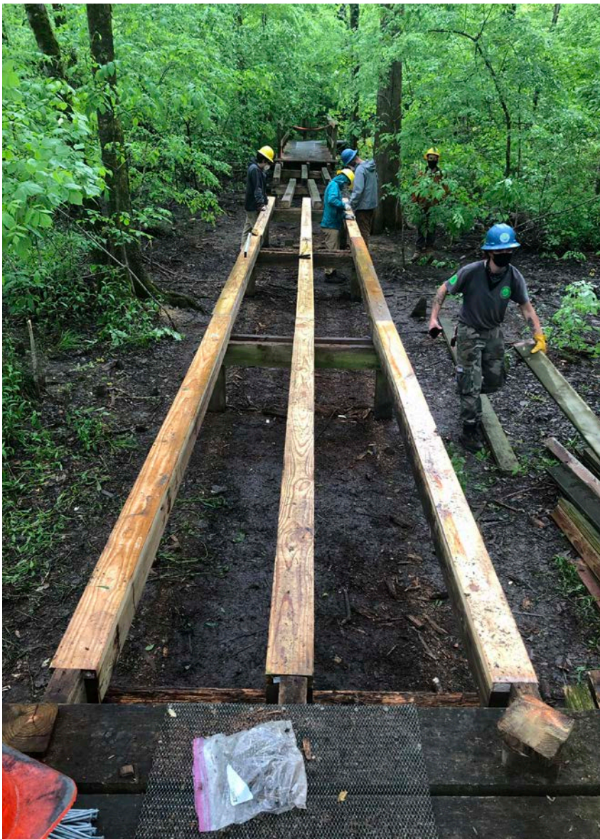
Southeast Conservation Corp crew members rebuild boardwalk.

product called SolarWinds was altered by a foreign state adversary to break into computers and access sensitive information. Interior, as one of several agencies exposed to compromise, worked with DHS to implement critical cybersecurity safeguards to detect system defects and mitigate and prevent cyberattacks. Of the increase, $16.0 million will maintain those safeguards, which have proven to be uniquely effective in protecting against the SolarWinds threat, and $5.4 million will fill other critical gaps in Interior's cyber defensive capability. Finally, the remaining $4.1 million will support implementation of a central cyber analytic solution needed to manage the Department's portfolio of cybersecurity capabilities.