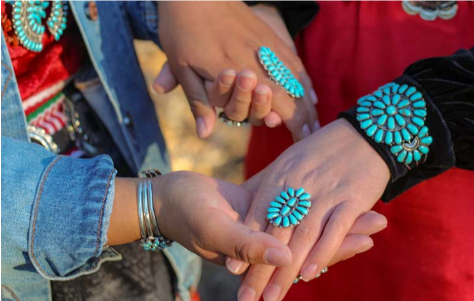
Youth from Northern Arizona unite in support of Missing and Murdered American Indians and Alaska Natives Awareness Day 2021.

million. This increase includes $10.0 million in additional funding to implement public safety changes resulting from the McGirt v. Oklahoma Supreme Court decision, which created an immediate and severe shortage of police and investigative personnel in the vastly expanded Tribal criminal jurisdiction areas. The budget adds $10.0 million for body-worn camera systems for police and correctional officers in Indian Country to improve accountability and transparency in law enforcement and $15.3 million to expand workforce capacity in law enforcement programs. An increase of $8.0 million for Detention/Corrections will improve workforce capacity and technology needs in those programs. The budget includes $26.8 million for Tribal Justice Support programs, which include VAWA training and implementation strategies critical to the protection of women in Indian communities.