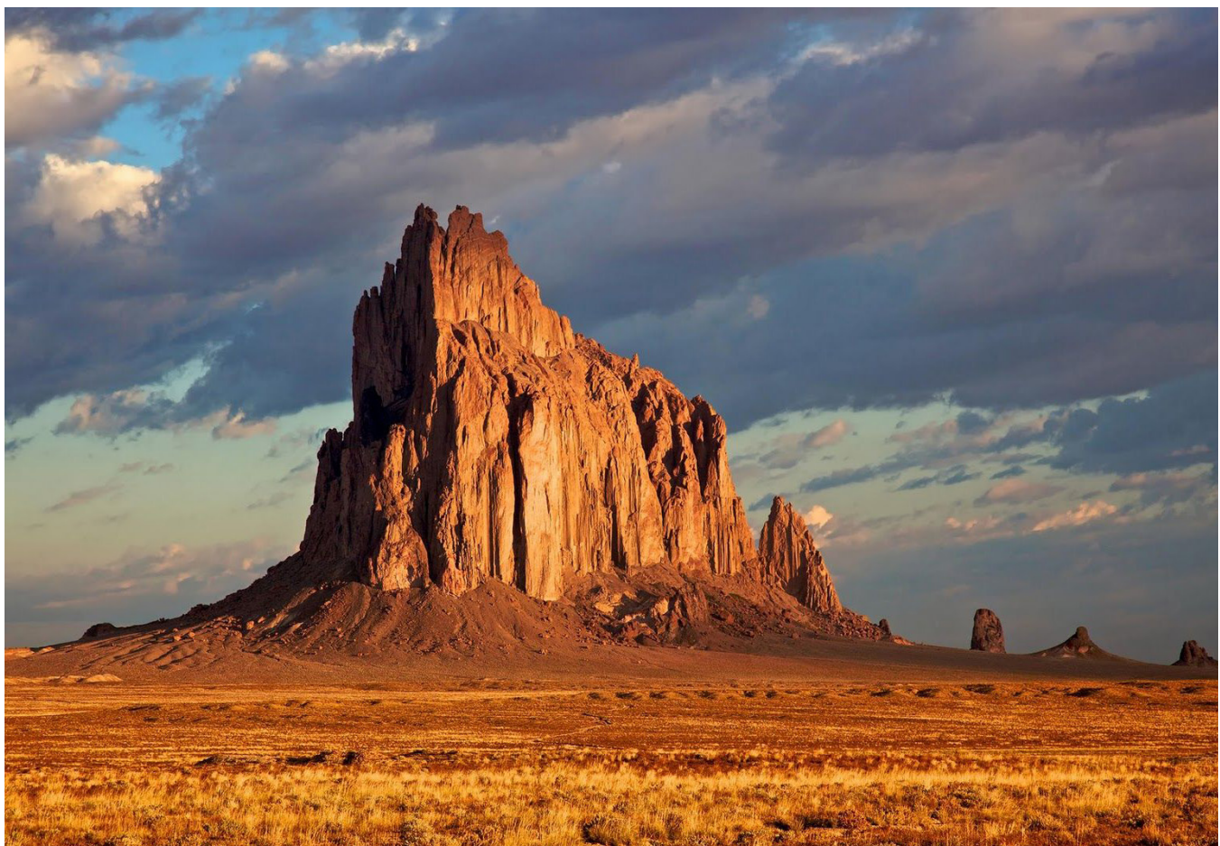
Shiprock rises above the high-desert plain of the Navajo Nation in San Juan County, NM.

Contract Support Costs —The President’s Budget reflects the Administration’s support for the principles of Tribal self-determination and strengthening Tribal communities across Indian Country by fully funding Contract Support Costs. Contract Support Costs enable Tribes to assume responsibility for operating Federal programs by covering the costs