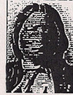
CHIEF BLACK COAL